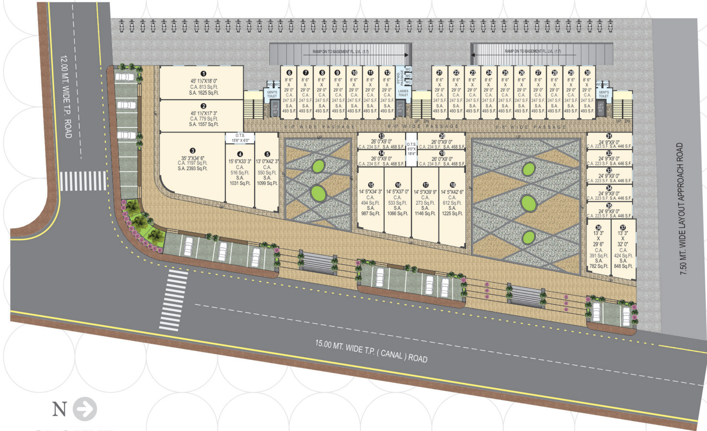
N → GROUND FLOOR PLAN