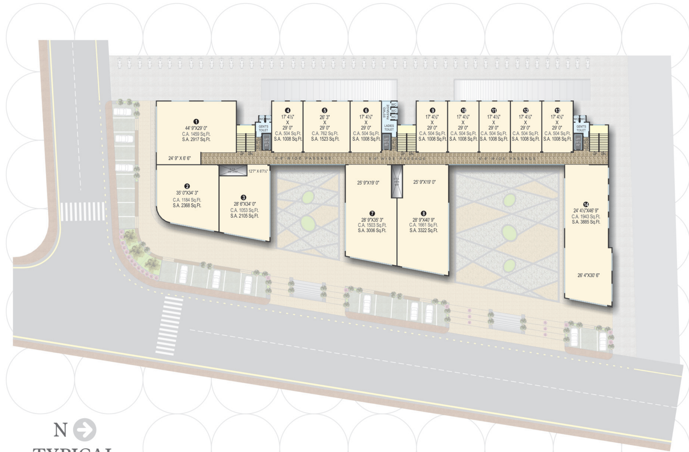
N → TYPICAL FLOOR PLAN (3 RD & 4 TH )