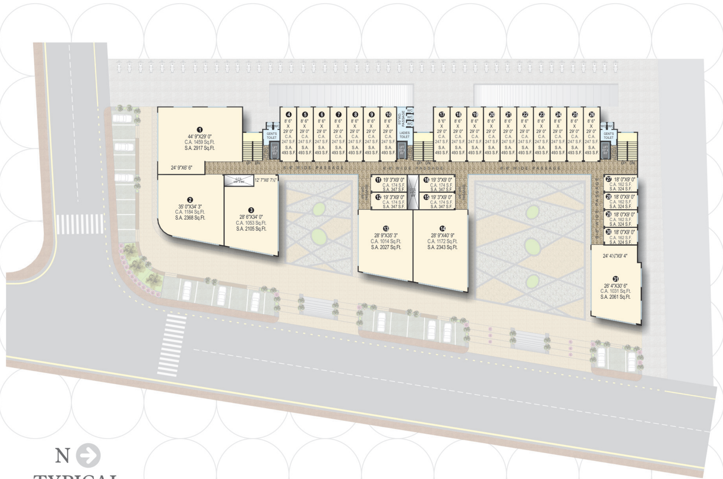
N → TYPICAL FLOOR PLAN (1 ST & 2 ND )